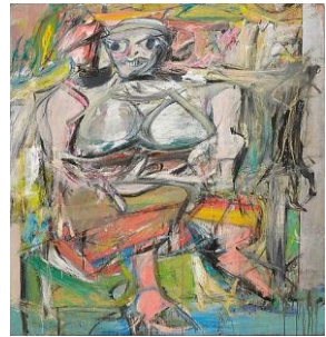
66. Woman I, 1950-52, oil on canvas, 75 1/8" x 58", The Museum of Modern Art, New York, Purchase (478.1953), Digital Image © MoMA, N.Y.

Painting helps my anger get out and it has to be free from rules, therefore gesture is extremely important. This sets the first layer in my paintings, therefore if the gesture isn't what I expect it to be I have to keep on going till I find the gesture that talks and only after that comes the second layer. Originally my prints didn't incorporate gestures, but this changed too. Printing involves a different process where that same gesture is added on top of the print with oil paint. I also have discovered how to use different techniques where I am incorporating the gesture while doing the print.