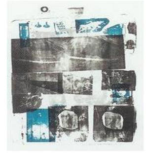
31. Rauschenberg, Guardian (Foster Cat. #58), 1968, Prints and multiples, 106.7 x 76.2 cm.