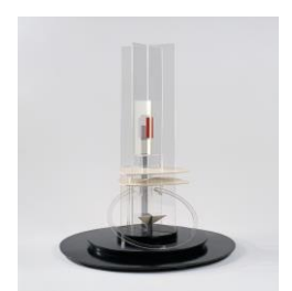
80. Naum Gab0, Column, ca. 1923 (reconstructed 1937), Perspex, wood, metal, and glass, 41 1/4 x 29 1/2 inches (104.5 x 75 cm), Solomon R. Guggenheim Museum, New York, 55.1429, Naum Gabo © Nina & Graham Williams, Sculpture

The result was that I could see my print straight and when I would turn the semi transparent paper I could see it in rivers, therefore the same way it was originally drawn on the copper plate. After doing an edition of ten prints, I decided that it would be more interesting if my next editions were smaller editions. At the end of this process I would find that I would prefer to do editions of maximum three, or just monotypes. My next problem was how to frame those new prints so that the audience could view both sides, I decided to create double glass frames. This artist was particularly interesting to me due to the material he used and how he interacted with the space, after seeing his work I started doing the sculptures that I previously talked about that had plexiglass involved.