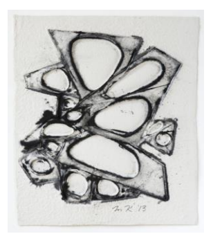
41. Mel Kendrick, untitled, cast paper, 59.25 x 49.75 inches, 2013