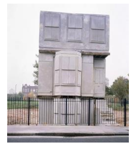
70. 'House' (1993)