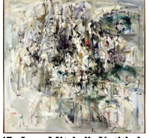
47. Joan Mitchell, Untitled, 1953. Oil on canvas, 52.5 x 55 x inches (133.35 x 139.7 cm). Walker Art Center, Gift of the T.B. Walker Foundation, 1956.