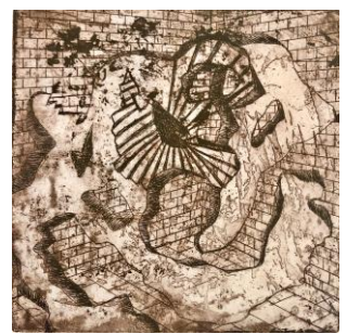
Composition 70 (Prison) Size: 6" x 6" Media: Etching & aquatint

Composition 70 was done when I first discovered Naum Gabo and his transparent sculptures were particularly inspiring. shows an enclosed space from which you might think you can get out but the road made of stairs that would allow you to get out is impossible to reach and takes you back inside, just as if you were in jail, or when you suffer a trauma the road to recovery is long and seems impossible for many to reach.