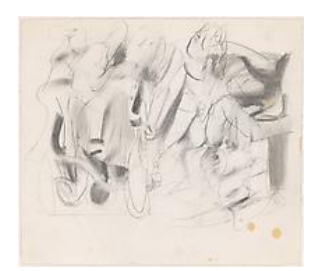
67. Figures with Bicycle, c. 1969, graphite pencil on paper, sheet: 11 1/2 \times 13 \times 1/4 inches