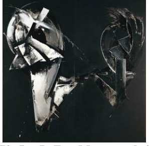
79. Jay DeFeo, Masquerade in Black (Loop System No. 4), 1975. Synthetic polymer and mixed media on Masonite, 96 \times 96 in. (243.8 \times 243.8 cm). San Francisco Arts Commission. © 2012 The Jay DeFeo Trust / Artists Rights Society (ARS), New York. Photograph by Ben Blackwell

Naum Gabo was a Russian abstract sculpture of the 20th century that moved to different countries escaping the Russian war first and then WW2, and found new contexts for his creations. He was one of the pioneers of Kinetic art and Constructivism, criticizing Cubism and Futurism for not being fully abstract. He thought that the viewer experience was fundamental when creating art. He used materials of all types (nylon, wire, metal) including transparent materials (glass, plastic). His creations give a sense of spatial movement. He also did prints. He combines geometric abstraction that is very organized. His exploration of space and time were particular, he