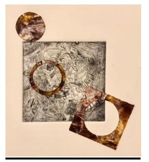
Composition 69 (Full moon) Size: 10 1/2" X 10" Media: Etching & collage 2019

After each new print I would review my previous prints and found I didn't like them as much as the new one. I knew I had work to do but didn't know exactly what yet. So one day I cut one of my prints that was done using glass, in six different shapes. Then I glued three pieces on top of two of my less favourite prints. It resulted in two compositions: Composition 69 and Composition 71.