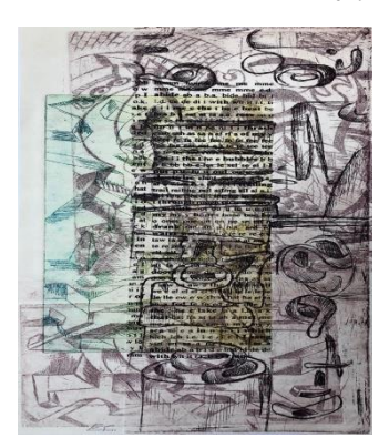
Composition 20 Size: 12" x 5 1/2" Media: overlapping etching plates, mono print 2019

This was the first time I overlapped plates in the printing process. It had taken a long time to discover and achieve this result. At this point I was overlapping only etching plates. Almost a year later I realized I could overlap different types of plates. I discovered this possibility when I printed over the prints left behind by other students in the garbage or recycled paper drawer.