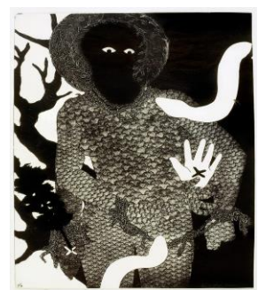
43. "La Sentencia" (1993)© Estate of Belkis Ayon, Courtesy Landau Travelling Exhibitions