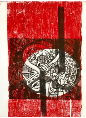
Composition 7 Size: 7 1/2" x 11 1/2"

Composition 7 is based on an etching where I was asking myself why do people suffer abuse. That being the only question that I haven't been able to answer and where there is no real answer. This is why the etching plate has a big question mark. The question mark is done in reverse because when I decided to do the design like I previously pointed out I transform or distort letters and words and in this case the transformation consisted in inverting the letter.