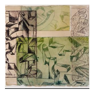
Composition 27 Size: 5 1/2" x 6" Media: overlapping etching plates, mono-print 2019

After realizing I couldn't reproduce my prints if I overlapped them I considered overlapping the same print over and over on the same paper. The result was astonishing and completely different. What I came to understand was each print could give me numerous new and unique works. What would happen if I would overlap different prints? Composition 20 is an example of overlapping three different prints on one paper. I had just discovered how to create from a few prints multiple different works. I realized I now could finally represent each person who shared with me their individual traumatic past through one monotype print.