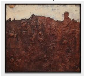
56. Jean Dubuffet, Soleil san Vertu 1952, oil on masonite, 36 x 32 x 2 1/2 in