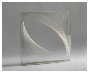
83. Naum Gabo, Linear Construction in Space No. 1, ca. 1945–46, Perspex with nylon monofilament, 17 5/8 x 18 x 3 7/8 inches (44.8 x 45.7 x 9.8 cm), Solomon R. Guggenheim Museum, New York, Solomon R. Guggenheim Founding Collection, 47.1101, Naum Gabo © Nina & Graham Williams, Sculpture

Arnaldo Pomodoro was one of the latest artists I discovered. Specialized in sculpture he pays a lot of attention to the light, may that be natural or artificial light. Arnaldo Pomodoro in conversation with Tim Marlow in London was extremely important to me. When he was asked if he had always wanted to be an artist. He is particularly known for his bronzes but I discovered that he also did a few prints that recall his sculptures. Very simple shapes (arrows, lines and circles). With very few details he is able to create some elegant sculptures, what I loved in his case was the simplicity and elegance of his abstract pieces. He reminded me of Wassily Kandinsky for his abstract simplify synthesis. It made me think less is more, so I went ahead trying to simplify some of my pieces and that was really a hard task because my process is at the opposite end. So I started doing smaller pieces so that I wouldn't have so much space for overworking the piece and the results were very interesting and took me to a completely new direction with Composition 6, but before getting to do that piece I had to go through the stage of composition 25 (where obviously more is more). This took me in paintings to do Composition 74.