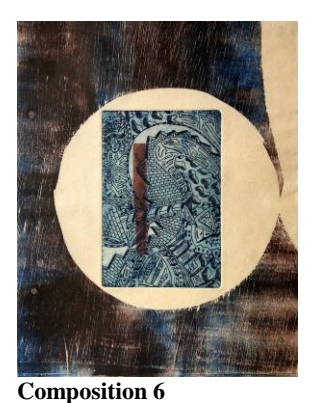
Size: 9 3/4" x 12 1/8"

Media: woodcut etching aquatint viscosity mono-print