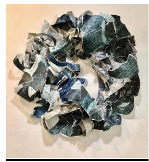
Composition 12 (The Circle of Life) Size: 4 feet length x 4 feet width X 13 inches height Media: torn prints and glue

With Composition 12 (The Circle Of Life) I was able to incorporate sculpture in a meaningful way with my painting and printmaking. I used to do sculpture with other materials but the connection with the rest of my work was never there and it took me a long time to figure out why. After many attempts using various materials to create sculptures I felt depressed and frustrated. I knew it was possible but struggled for a solution.