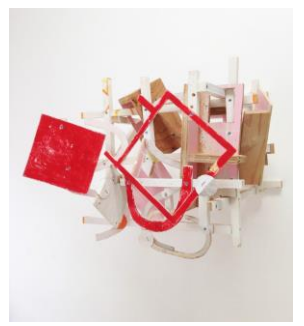
99. Kenji Fujita, "Accumulation 6" (2016)