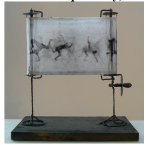
64. June Leaf, "White Scroll with Dancing Figures" (2008), mixed media, 17 x 17 x 11.25 inches (click to enlarge)