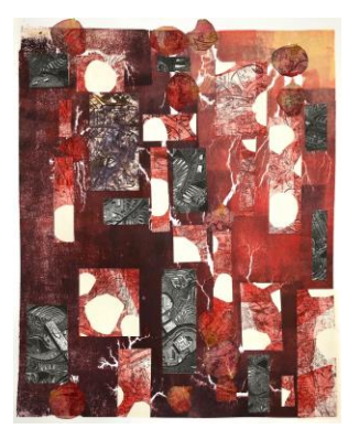
Composition 11 Size: 22 3/4" x 18 1/4" Media: collage of red rose petals, woodcut, etching, aquatint, black ink

This work represents my father who has been suffering from a particularly rare lung disease. In all his years of suffering he was a guinea pig for the medicine. That tried all types of things on him. What made me do this piece is that doctors refused to let him go in peace and would try new things on him, but by doing so his disease progressed at a faster pace and caused his health due to the faster deterioration of his lungs.