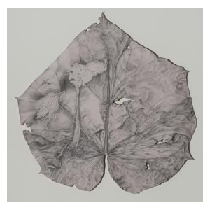
50. Stephanie Garmey, Graphite on Cut Paper 27 x 27 inches