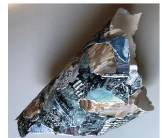
Composition 72 (Pearl) Size: 10" W x 10" H x 18" L, Media: sculpture collage, pencil, etching, aquatint, drypoint, pastel, pencil

Although originally I did not want to talk about myself in my art I realized that it might be an important step that I would have to take in order for the public to understand that I truly understand the subject of my thesis. It took me almost two years to finally point out to the viewer that this was a self-portrait. A necessary step had to be done in order to explain to the public that my choice of talking about sexual, physical and psychological abuse was also due because I know the subject extremely well having had to deal with it myself.