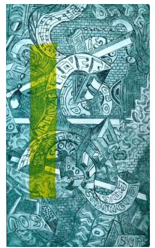
Composition 68, New York Size: 9" x 3 1/4"

Composition 68 came to be after Composition 30 and Composition 31. When doing this print I wanted to make sure that people would see the different planes so I had to really push myself when drawing the design and concept of overlapping shapes. I would push this even further with the print that I was to develop late, Composition 10.