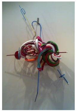
36. Frank Stella, "k.305 (ABS Red)" (2012), mixed media, 94 x 75 x 33 inches