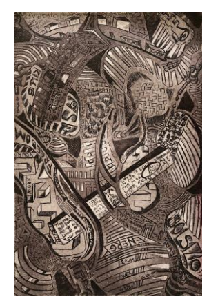
Composition 10 (Solstice / PTSD Kills) Size: 9 1/8" x 6 1/4" Media: mono-print etching & aquatint

I have often seen other texts written in other languages, living in different countries made it easy to have direct access to so many languages, as for example Arabic. Therefore I already know other languages have letters that are totally different that I will explore in my future to add a variety of lines and shapes to my work.