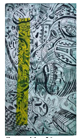
Composition 26 Size: 6" x 12" Media: etching, viscosity 2019

Composition 26 is part of a series of 4 pieces that represent 4 different people. Naum Gabo was the artist I was looking at when I started this work and in particular his use of space in his transparent 3D work. This one represents a person that is a drug addict that came to that after having been sexually abused. The name of the person is not on the work but you can see some details of what the person likes as for example the person likes to play piano and chess. Only after doing this piece I decided to go further with some descriptions and describe people that have lived injustices like the next print that is also part of this series. This work talks about a person that used to take drugs and unfortunately still uses it, he loves to play piano. He is so angry against society because he can't find a job at his level of education simply because he came from another country when he was younger with his family and doesn't have an American nationality. He has tried so many times and at the end just gave up turning to drugs to find a profit to live.