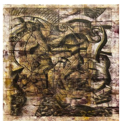
Composition 35 (Intertwine) Size: 6" x 8" Media: Monotype, etching & roller 2019

Composition 35 is one of my favorite pieces. I was looking at Joan Mitchell at the time when I started this work. This work started off by putting oil on a paper using a roller and then overlapping other prints over it.