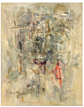
49. Joan Mitchell, Untitled, 1954. Oil on canvas, 36 x 28 1/2 inches (91.4 x 72.4 cm). Private collection. © Estate of Joan Mitchell.