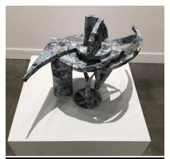
Composition 73 Size: 11" W x 19" H x 11,5" L Media: wood & print collage, 2019

Composition 73 is a woodcut covered with prints. I paid a lot of attention in the composition of this work since I wanted to play with shadows too. The angle of the light that goes on the sculpture is important in this work. In fact I had to turn the piece different times to find the perfect way to show the work and to show the angle I wanted to show as you can see in the photo.