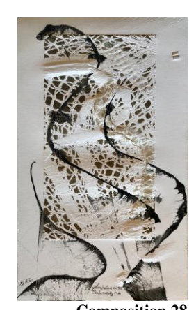
Composition 28 Size: 10 1/2" x 5 1/2"

Composition 28 was the first piece where I applied the theory opposite to my way of thinking: less is more. After seeing Mel Kendrick prints and Jay Defeo paintings I left untouched spaces in my this piece to let it breathe. This process would have me adding different techniques and plates in order to create the empty spaces. Using just one color and different tones in the first layered collagraph, but the color was hard ground it wasn't ink. By doing so I expanded my research to other materials that were not generally used as paint.