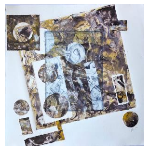
Composition 120 (Stereo) Size: 10 1/4" X 12 1/8"

two Compositions 69 and 71. After seeing Raushenberg and Frank Stella techniques in printmaking I considered how I might come up with something unique and innovative that would push the idea of printmaking using three different techniques assembled in one work. This composition is an etching, collage and glass print, here I am pushing the illusion so that the viewer has to go really close to the piece to discover that the parts glued on the etching print are the stencils used when printing on top of the etching print using plexiglass. I discovered another technique that gives great results and sets me up to make some unique work in the future.