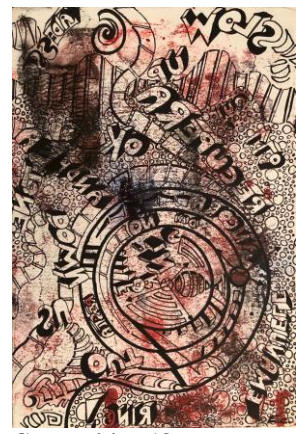
Composition 18 imp Size: 11 1/4" x 7 1/2" Media: print from glass & black ink 2020

Composition 18 is the third print in the tryptic. My dad had a particular nurse who was very nice. I discovered during this time my father had suffered a lot in his life. My father's name is on this plate, written in Italian and in reverse as an homage to his beautiful interior.