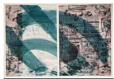
Composition 23 18" x 24"

I had already done some work where I had added painting after doing a print but I could only add oil paint at that point in order to be sure the print would be archival. I wanted to find a way to keep my work archival but have water color or acrylic on it too. Composition 23 is one possible solution. But after looking at Rauschenberg's overlapping works, and completing Composition 20 and 120, I thought to combine the ideas of those two compositions on top of adding another painting process in the