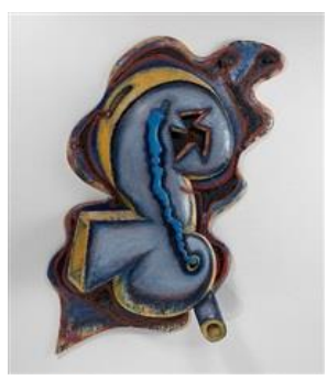
23. Elizabeth Murray, Dust Tracks, 1993, Painting, Painted wood collage 172.7 x 119.4 x 25.4 cm