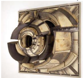
9. Lee Bontecou, Untitled, 1962, welded steel and canvas, 68 x 72 x 30 in