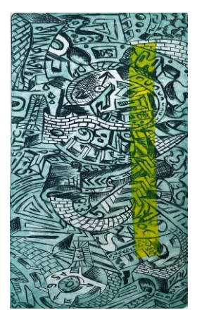
Composition 31 (Yang) Size: 9" X 3 1/2"