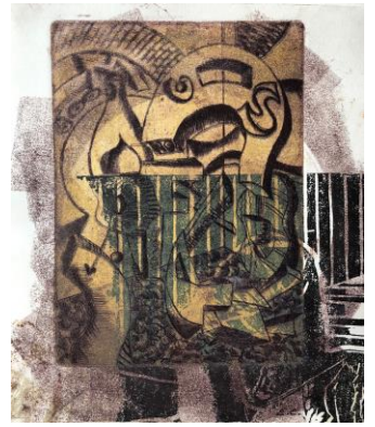
Composition 37 Size: 6" x 8 1/2"

With both Composition 35 and Composition 37 I used recycled papers with marks and imperfections. The sheets of paper were deemed imperfect and not usable for printing. I added some paint with the roller, and added different layers of etching prints pushing the work further I had done previously with Composition 20 and Composition 27.