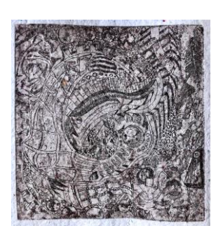
Composition 15 Size: 9 1/2" x 9 1/2" Media: etching, aquatint recycled paper 2020

Composition 15 started off using a plate recycled plate where someone else had done an abstract aquatint. I decided to do an etching over it and see what would come out. After etching my plate I made sure to get some strong dark lines that would show on top of the previous aquatint, just like I had done with the overlapped print described in the section of Composition 120, leaving the plate in the acid for 3 hours. I had to go through sanding the plate again a few times to get to the final result that was first printed on a BFK paper. Happy with the result I printed it on my recycled paper. Knowing that I couldn't damp that type of paper in the water because even if I had layered rice glue on both sides of the paper it could break by using that process I decided to spray a little bit of water on the part that was going to be facing