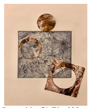
Composition 71 (Blood Moon) Size: 12" X 8" Media: Etching & collage, Mono-print 2019

These two pieces above represent the initial step of Composition 120 (Stereo) where I started incorporating collage (of other prints) on finished prints with the intent of creating monotypes. I was turning the page and changing direction. I already sensed that I didn't want to do just printmaking, but I wanted to incorporate other techniques in my printmaking world. These were the first positive attempts to create some kind of illusion and overlapping in my work.