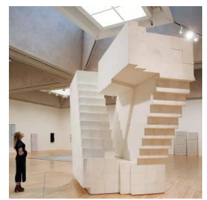
69. 'Untitled (Stairs)' (2001) © Dinendra Haria/i-Images