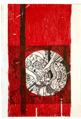
Composition 8 Size: 8" x 11 1/2"

Composition 8 is almost identical to Composition 7. It differs from the previous composition by just a line. This shows how with just one line you can get a completely different effect. The etching was originally conceived for a totally different purpose, since I wanted to expand on the question why people suffer abuse. This idea can always be expanded later. What came out from doing those two pieces is that things can overlap in real life too.