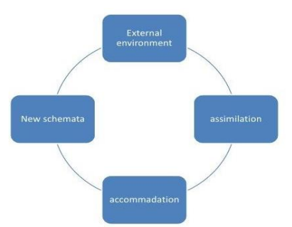
Figure 2. Equilibration

Piaget adds several important terms to his theory such as assimilation (when new information is integrated into our cognitive patterns or schemata) and accommodation (when new information from outside is adapted, transforming our cognitive patterns).